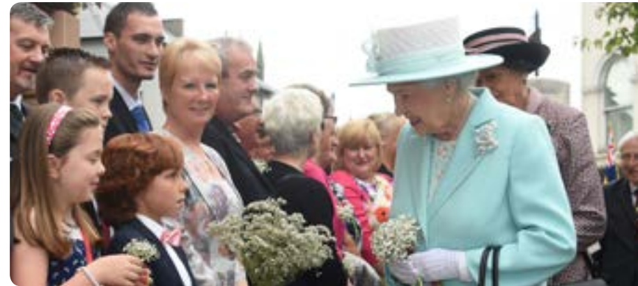
The Queen meets lots of people.

Elizabeth II is the Queen of the United Kingdom. She was born in 1926 and became queen in 1952. The Queen is married to Prince Philip and has a large family. She lives in Buckingham Palace in London. The Queen is very important. She visits charities and schools in the United Kingdom and welcomes world leaders to Buckingham Palace.