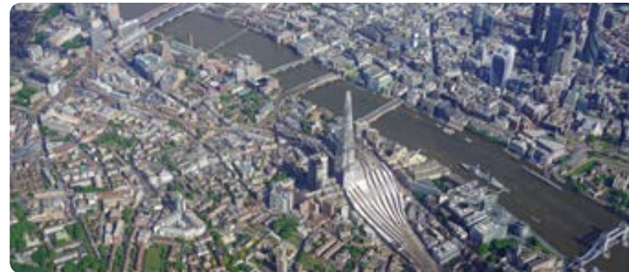
Aerial view of London

A city is a large, busy settlement where lots of people live and work. A city usually has a cathedral, a river, important buildings and offices where people work. There are lots of things to see and do in a city. There are many shops and restaurants to visit.