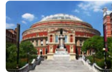
Royal Albert Hall