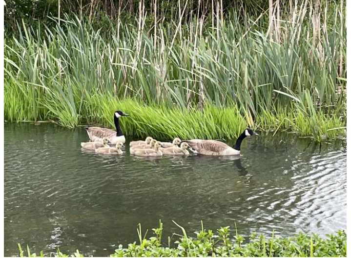
Evie B in Year 3